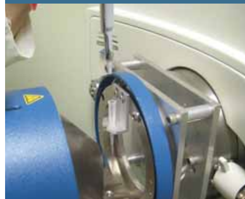
Eject DIP-it sample into Self-Aligning Positioner