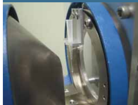
Optimum Sample Desorption Occurs in Seconds