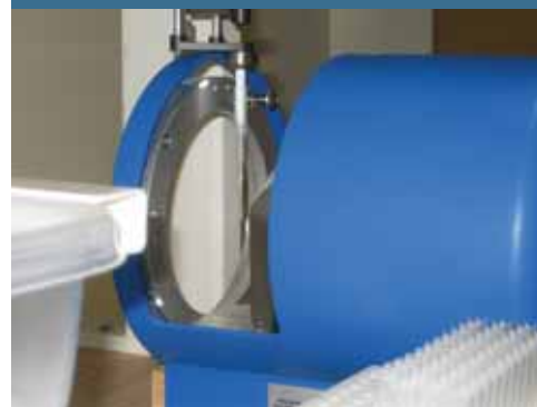
High Throughput Analysis with AutoDART